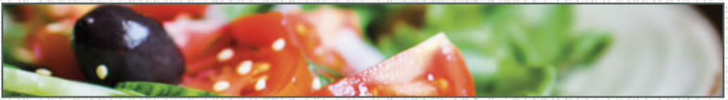
BE-LEAF IN YOURSELF