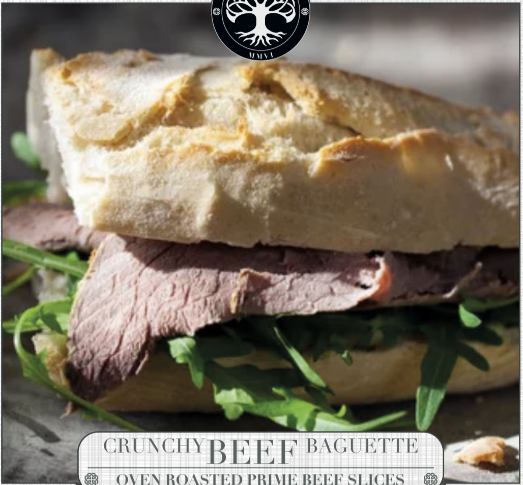
CRUNCHY BEEF BAGUETTE