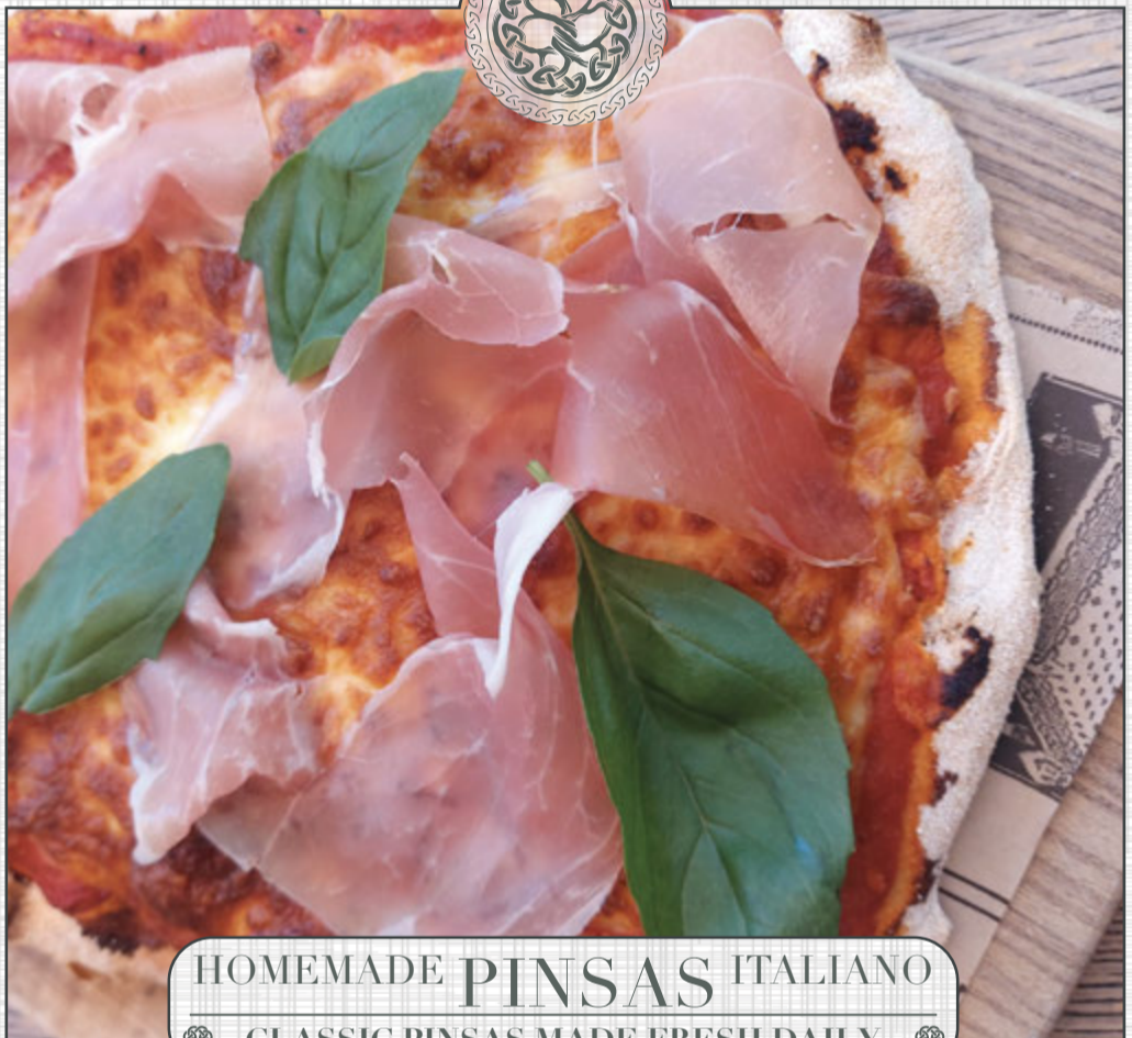
HOMEMADE PINSAS ITALIANO CLASSIC PINSAS MADE FRESH DAILY