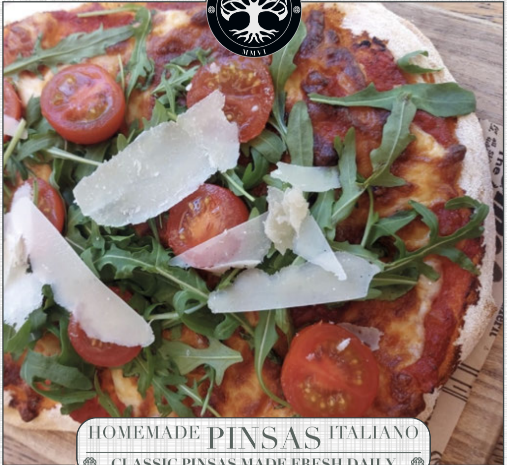
HOMEMADE PINSAS ITALIANO CLASSIC PINSAS MADE FRESH DAILY