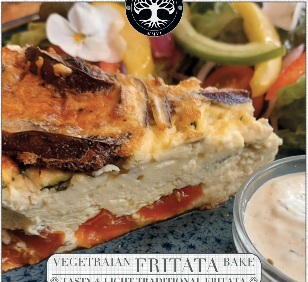
VEGETRAIAN FRITATA BAKE TASTY & LIGHT TRADITIONAL FRITATA